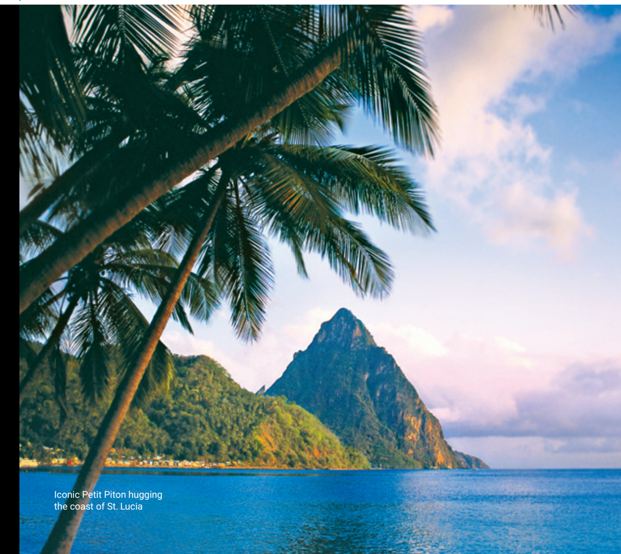
Iconic Petit Piton hugging the coast of St. Lucia

11-Night Southern Caribbean Cruise Celebrity Equinox Departs: Miami | September 3, 2018