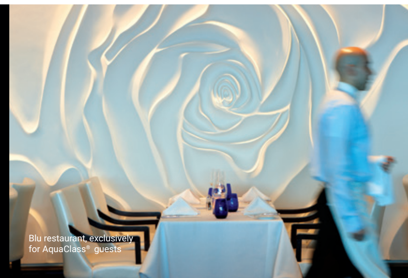
Blu restaurant, exclusively for AquaClass® guests